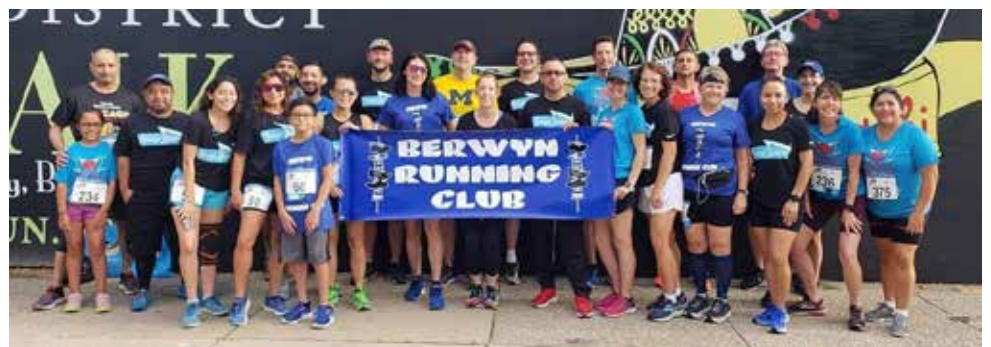
THE BERWYN RUNNING CLUB LED THE WAY IN RAISING MORE FUNDS FOR AWAKE'S EMERGENCY ASSISTANCE GRANTS

By August, more than 400 of you had come together to raise over $40,000, and this support helped us secure $25,000 in grants from two local foundations. And you didn't stop there – community volunteers