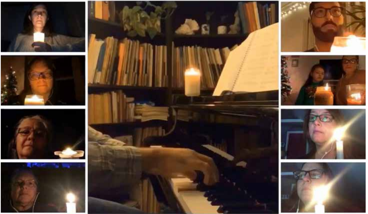
SINGING SILENT NIGHT TOGETHER ON CHRISTMAS EVE